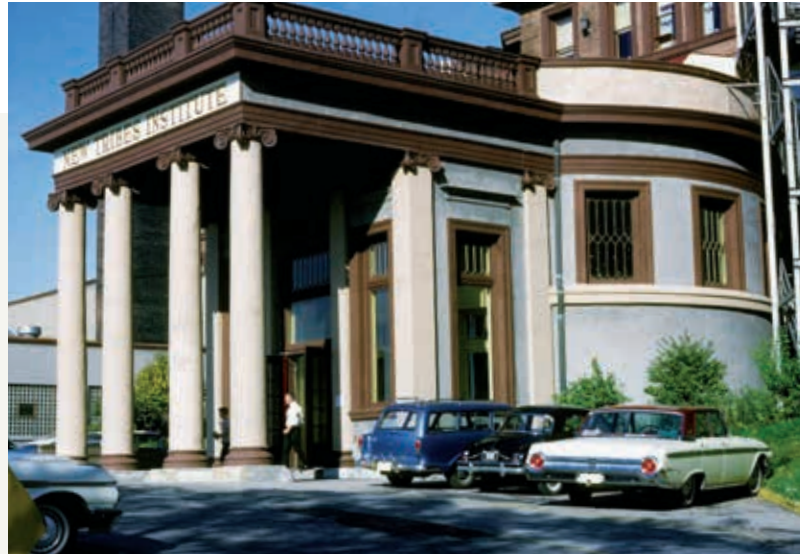
The Bible Institute circa 1960s